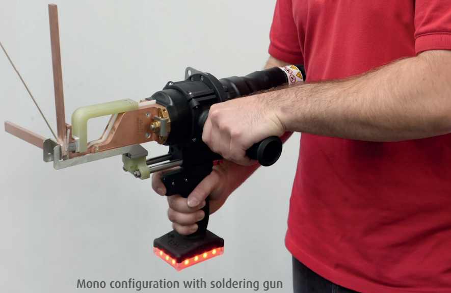
Mono configuration with soldering gun

When the preset heating time or temperature (only in combination with a pyrometer) is reached with the Heat Controller, a multi-coloured LED light signal, a vibration signal or an acoustic signal is optionally activated - also combinable.