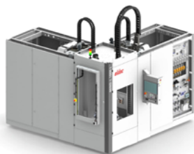
MIND-L 1000 L: Induction hardening machine for large quantities and numerous multi-processes, with maximum and constant precision