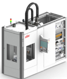
MIND-L 1000 S: Induction hardening machine for large quantities with maximum and consistent precision

The MIND-L 1000 series is based on a modular construction kit, which makes the construction forms S, L, T and I possible and therefore the adaptation to a wide range of tasks.