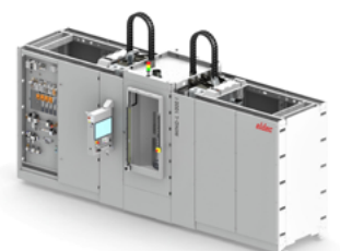
MIND-L 1000 I: Induction hardening machine for high volumes and process parallelisation, with maximum and consistent precision