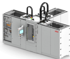
MIND-L 1000 T: Induction hardening machine for large quantities and multiple processes, with maximum and consistent precision